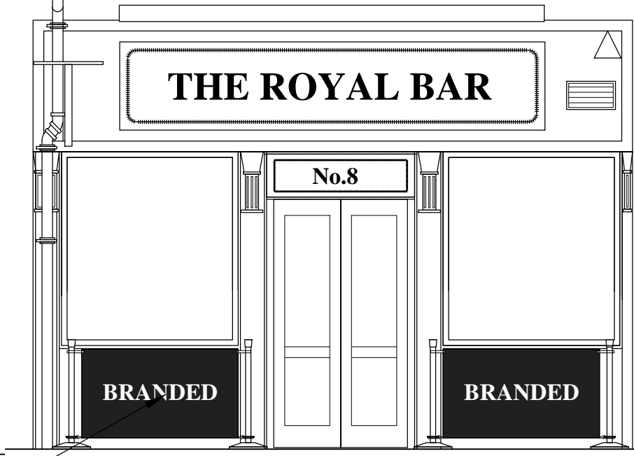
PROPOSED ELEVATION 1:50