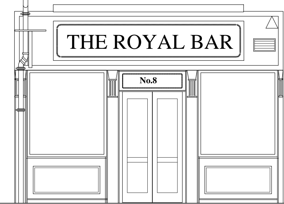
EXISTING ELEVATION 1:50